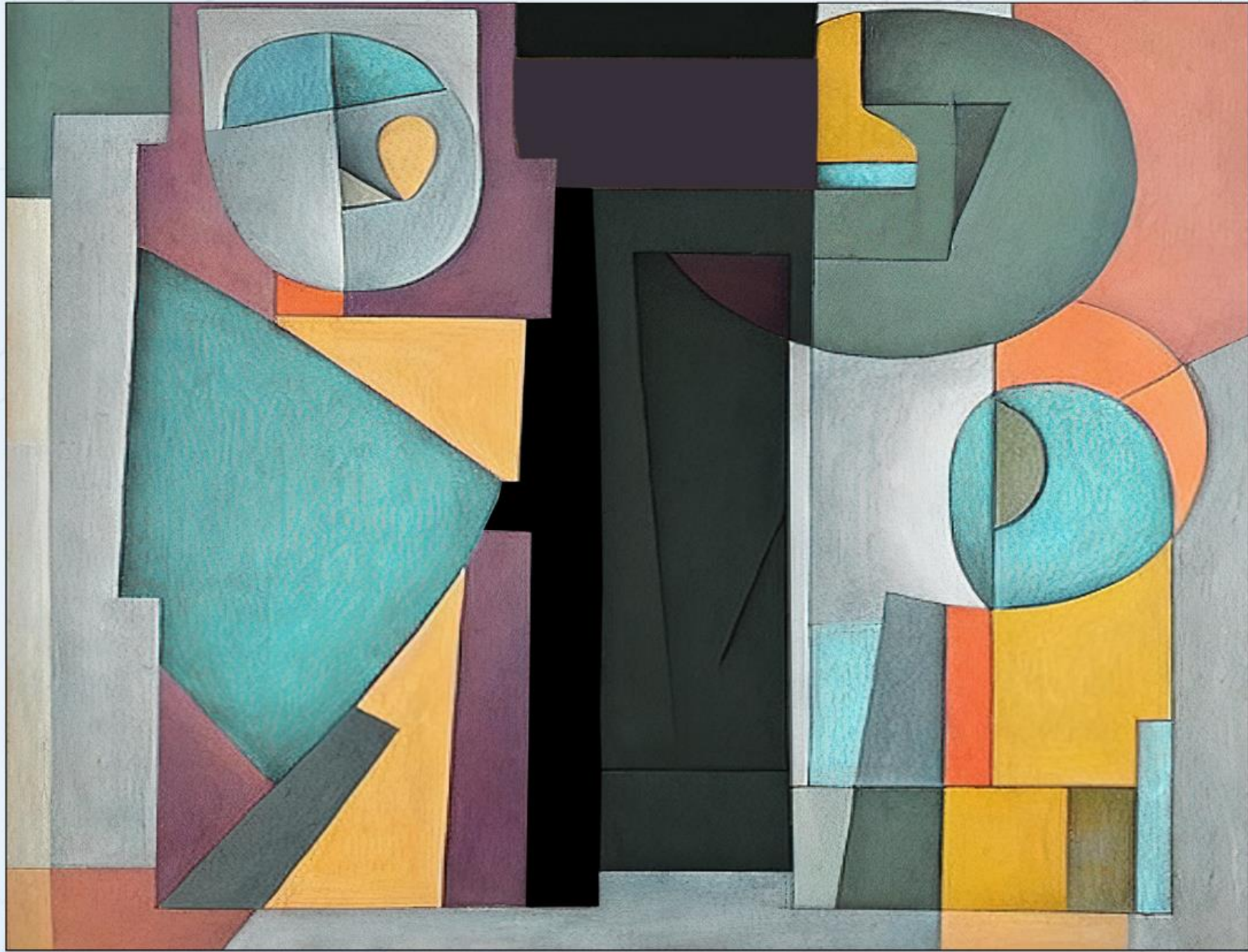
Abstract composition nr 9